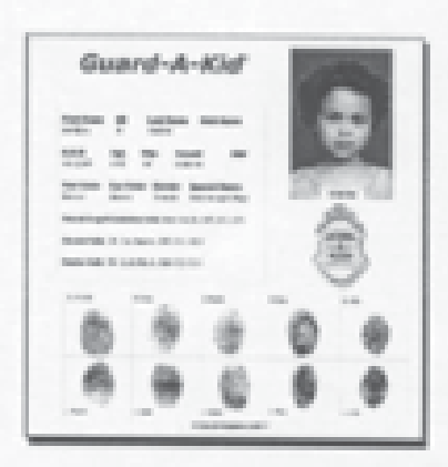
Full-size identification sheet

CD Rom stores your child's photo, vital information, and digital fingerprints. This information can be e-mailed to law enforcement agencies around the world!